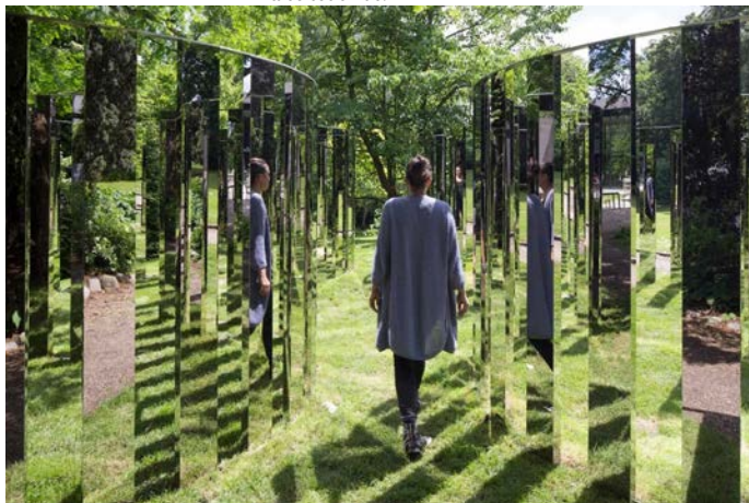
Shown is Semicircular Mirror Labyrinth II (2013) at an installation at Ordrupgaard, Charlottenlund, Denmark.

This exhibition brings together works that exist at the crossroads of art, architecture and technology and responds to the character of BBP. On